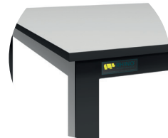
Trespa Top Options Available